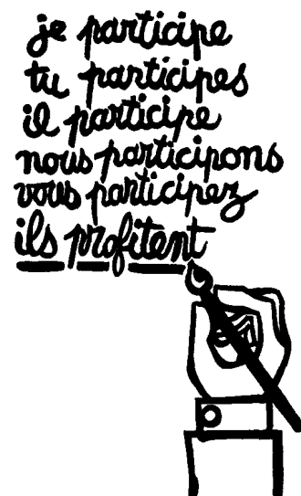
FIGURE 1 French Student Poster. In English, I participate; you participate; he participates; we participate; you participate . . . They profit.

There is a critical difference between going through the empty ritual of participation and having the real power needed to affect the outcome of the process. This difference is brilliantly capsulized in a poster painted last spring by the French students to explain the student-worker rebellion. 2 (See Figure 1.) The poster highlights the fundamental point that participation without redistribution of power is an empty and frustrating process for the powerless. It allows the powerholders to claim that all sides were considered, but makes it possible for only some of those sides to benefit. It maintains the status quo. Essentially, it is what has