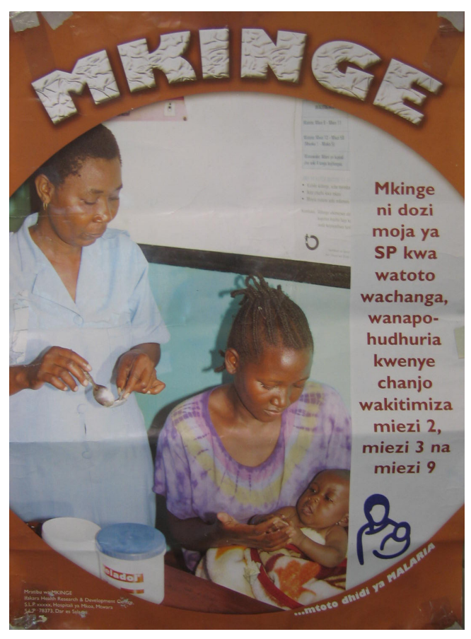
Figure I Draft version of poster to help health facility staff explain to mothers what IPTi is and when it is given.

Health Institute in July 2008). The posters were produced and distributed to health facilities in the first quarter of 2005 to support implementation of IPTi.