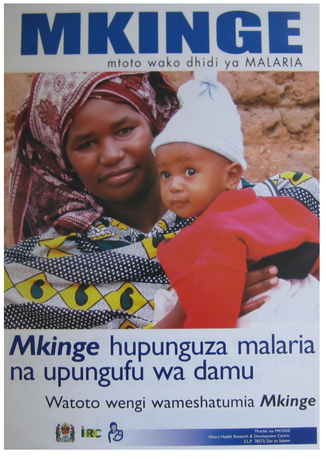
Figure 4 Final version of poster to explain the benefits of IPTi to mothers and to reassure them about the safety of the intervention.

There was an interest to explore rumours about SP because negative perceptions have been reported to affected behaviour and uptake of other reproductive health services [13]. Rumours about adverse effects of SP in our study featured in a few peri-urban settings, originating from hearsay and newspapers. Debates among researchers and decision makers prior to change of first line antimalarial treatment from chloroquine to SP also contributed to these widespread rumours [14]. Yet, many respondents had personally or knew others who safely used SP for malaria treatment or IPT in pregnancy. None of the respondents in our study had first-hand experience of adverse effects of SP and there were no vivid local examples about it. Implementation of IPTi with SP was, therefore, widely welcomed, especially after information that it would be through the routine health delivery system which they trusted. The extent to which the source of IPTi is trusted might influence decisions about IPTi.