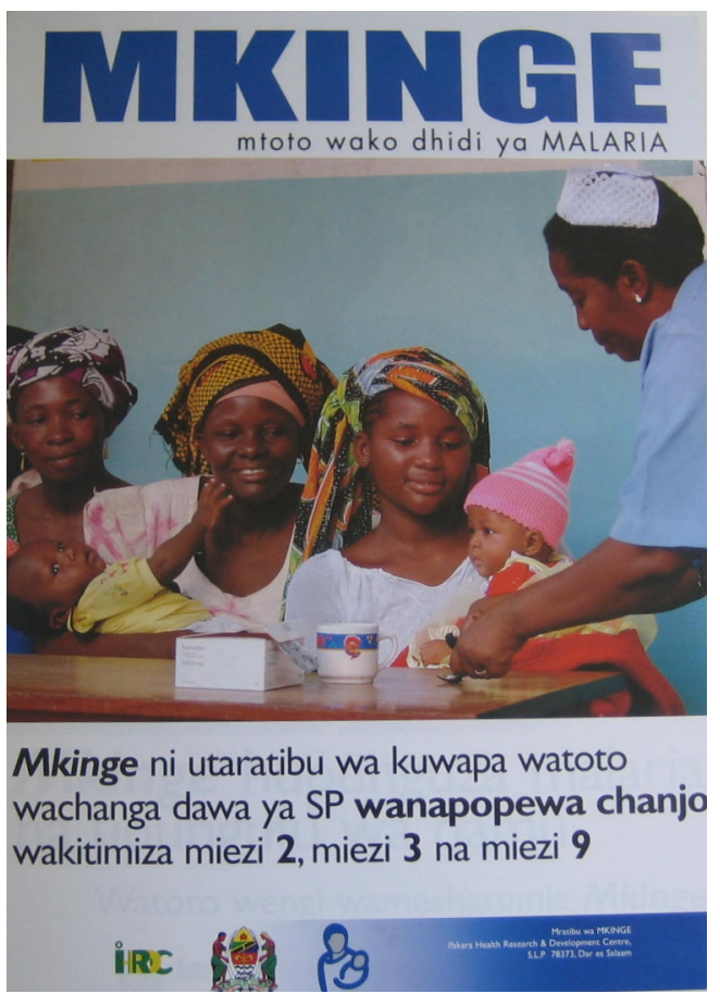
Figure 2 Final version of poster to help health facility staff explain to mothers what IPTis and when it is given.

Several women were interviewed who had probably used IPT in pregnancy but were unaware of it. There was no